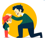
Happy Father's Day

God took the strength of a mountain, The majesty of a tree, the warmth of a summer sun, The calm of a quiet sea, the generous soul of nature, The comforting arm of night, the wisdom of the ages, The power of the eagle's flight, The joy of a morning in spring, The faith of a mustard seed, the patience of eternity, The depth of a family need, Then God combined these qualities, When there was nothing more to add, He knew His masterpiece was complete, and so, He called it ... Dad (Author Unknown)