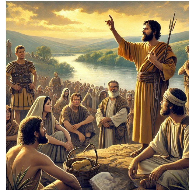
“The word of God came to John, Son Of Zechariah in the wilderness”