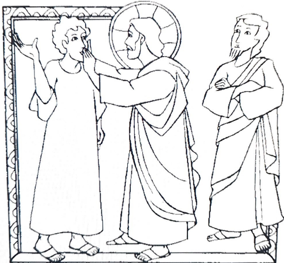
"Ephphata - Be opened"