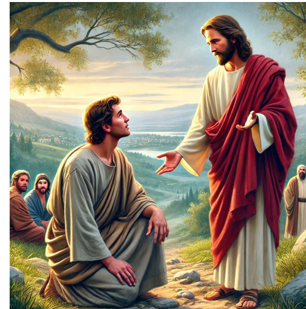
"The man was shocked and went away grieving, for he had many possessions"

St. Therese of Lisieux School 905-835-8082