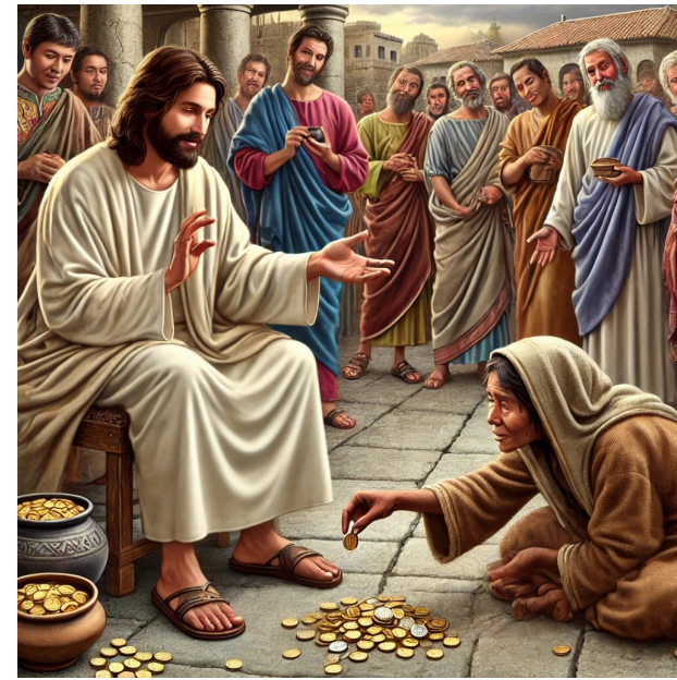
"this poor widow has put in more than those who are contributing"