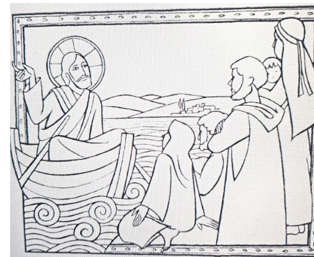
"He began to teach them"