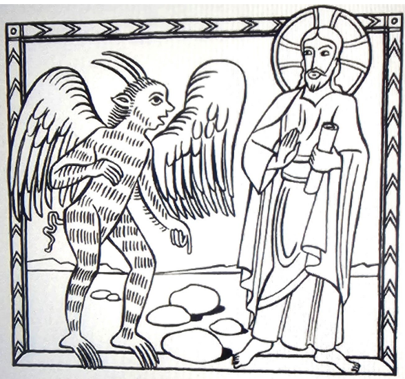
He was in the wilderness forty days