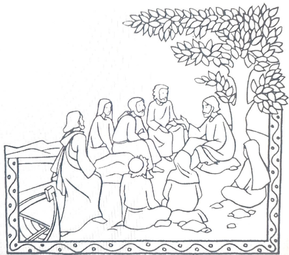
"Do work for the food that endures for eternal life"