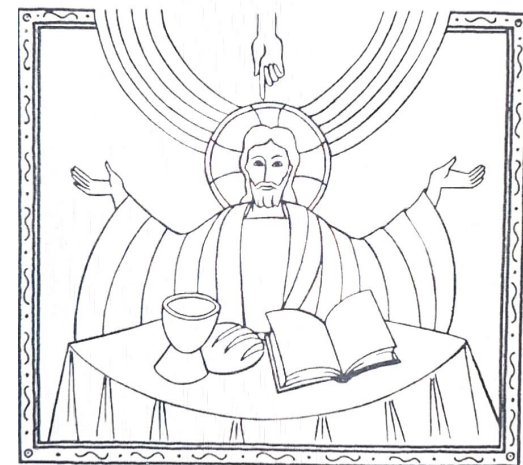
"I am the Bread of life"

St. Therese of Lisieux of the Child Jesus and the Holy Face Catholic Church 379 Fares Street Port Colborne, ON L3K 1W9 email: thereselisieux@cogeco.net Web: http://stthereseperc.ca