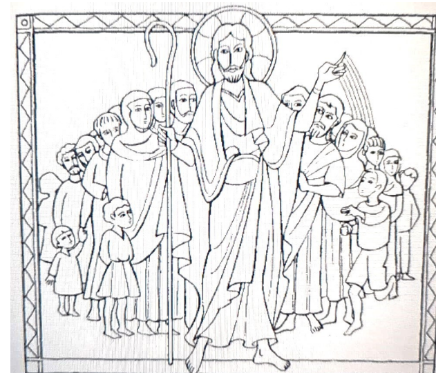
"I am the Good Shepherd"