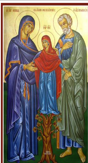
The Presentation of the Blessed Virgin Mary