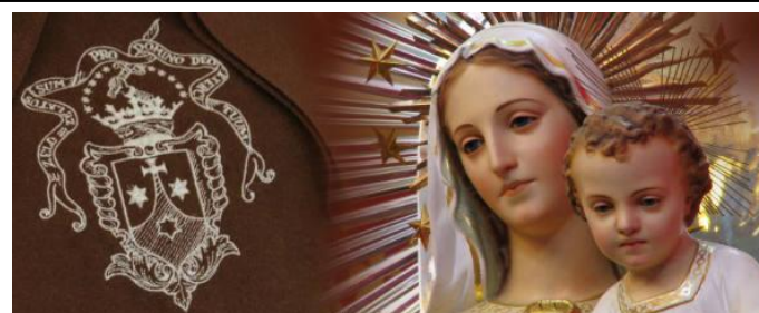
Our Lady of Mount Carmel, pray for us. - July 16 th