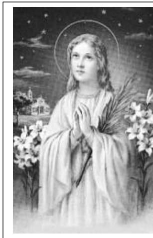
Memorial of Saint Maria Goretti is celebrated on July 6 th